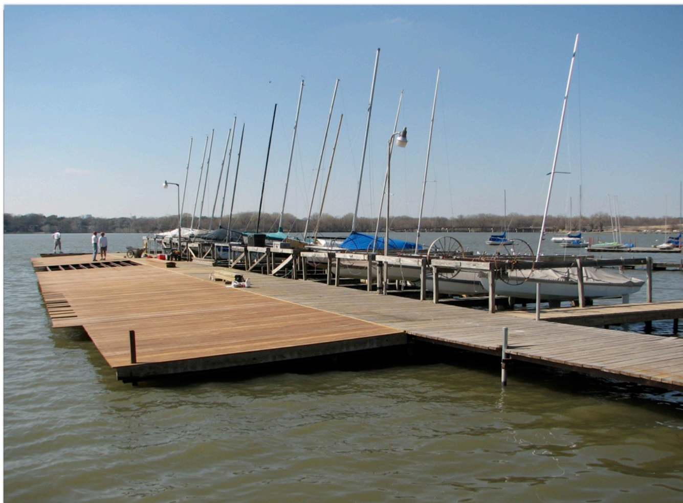
The new board boat pad, on March 15

The new board boat pad is almost complete. Work parties over several Saturdays have completed installing the ten-foot wide walkway, and most of the Ipe boards are installed, except for the small gap visible in the picture. The Ipe board ends will be trimmed off and used for davit walkways. On Spruce Up Day volunteers will labor to close the gap and install the remaining fasteners in the boards already in place.